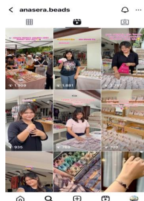
Picture 2. Anasera Instagram Account