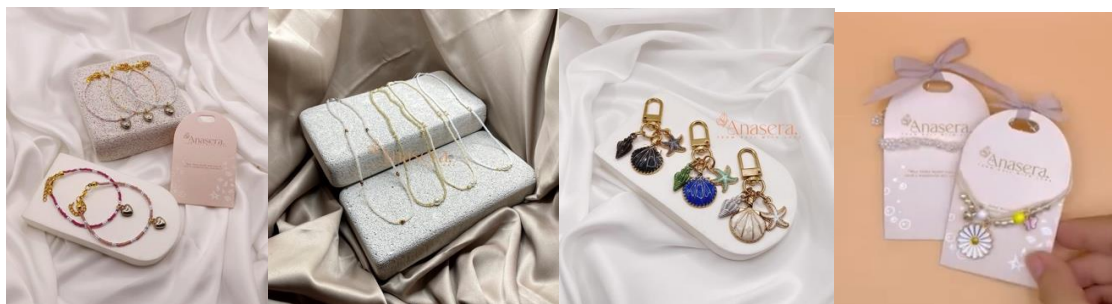
Picture 1. Anasera Newest Products and Packaging

Through the design development workshops, Anasera successfully created new variants of its beaded accessories. These included bracelets and necklaces with updated color palettes, thematic patterns inspired by Bali beaches and sceneries, and improved packaging that added value to the final products. The use of mood boards and trend analysis during the workshops enabled the owner to understand current market preferences, resulting in designs that were more appealing to both domestic and international tourists.