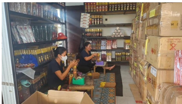
Figure 2. Packaging Process at Dupa Ayu Bagus Angkar