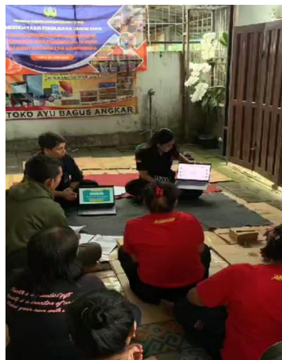
Figure 7. Digital Marketing Training

In addition to providing training and practical sessions on digital marketing, we also conducted a session on financial management. In this session, we not only covered the basic concepts of financial management but also included hands-on practice using Microsoft Excel. The primary goal of this session was to facilitate participants in recording their business finances.