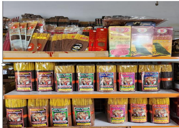
Figure 3. Products of Dupa Ayu Bagus Angkar

According to Winarni [7], common problems MSMEs face today include lack of capital, difficulties in marketing and raw materials, insufficient skills in production processes, weak financial management, and an unfavourable business climate. Dupa Ayu Bagus Angkar MSMEs also experience these issues, where both production and marketing processes are challenging. This MSME faces significant problems in marketing, production, and financial record-keeping. These issues must first be resolved to empower Dupa Ayu Bagus Angkar MSMEs optimally. To support the enhancement of production and marketing for MSME Dupa Ayu Bagus Angkar in Sangeh Village, Abiansema District, it is necessary to formulate a concrete action plan addressing product marketing strategies, production support infrastructure, and financial record-keeping. A deep understanding of the challenges and opportunities faced by MSMEs, combined with real efforts to strengthen their capacity and competitiveness, makes discussing empowerment strategies for MSMEs like Dupa Ayu Bagus Angkar in Bali highly relevant. Through a holistic and strategic approach, MSMEs can become a stronger and more sustainable backbone of the economy in Bali and throughout Indonesia.