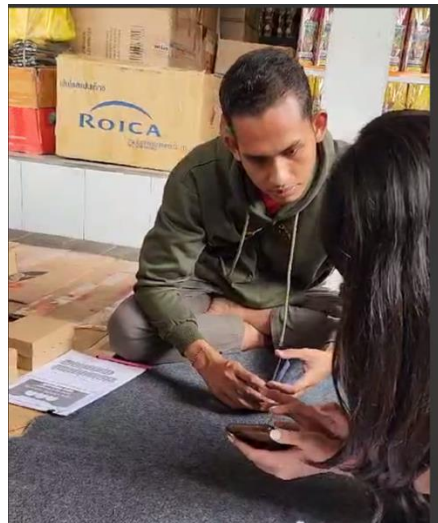
Figure 6. Social Media and E-Commerce Practice