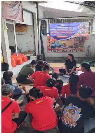
Figure 8. Financial Management Training

The digital scales provided are crucial for measuring raw materials with high precision. In industries like incense production, accuracy in ingredient measurements significantly impacts the final product's quality. With these digital scales, participants can ensure that each component of the raw materials is measured accurately, helping to maintain product consistency. The use of digital scales also reduces potential manual errors common with traditional measurement methods, thus speeding up the production process and minimizing waste.