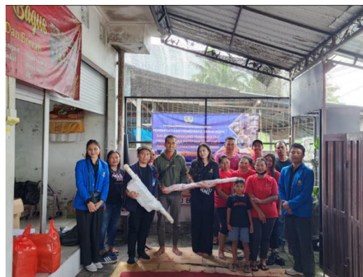
Figure 9. Handing Over Infrastructure and Equipment to UMKM Dupa Ayu Bagus Angkar

We believe that providing this infrastructure is a long-term investment that will help UMKM Dupa Ayu Bagus Angkar increase their production capacity. With the support of modern and efficient tools, participants can focus more on product development and marketing aspects and be better prepared to face challenges in a competitive market. Through this program, we hope to drive sustainable growth and improve the welfare of UMKM Dupa Ayu Bagus Angkar and its surrounding community.